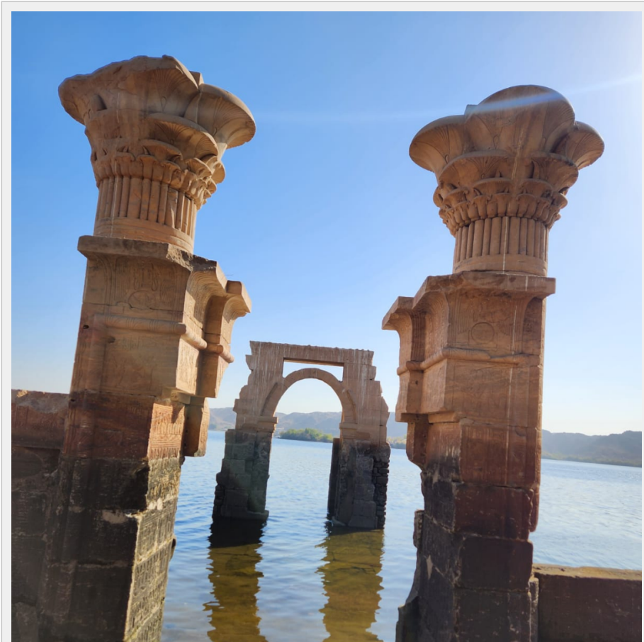
The entrance of the original Isis Temple at Philae Island

An odyssey, as the name suggests isn't without its challenges. At every point of the journey there was magic, there was also discomfort, emotions, karma rising up, and old-patterns resurfacing for all of us.