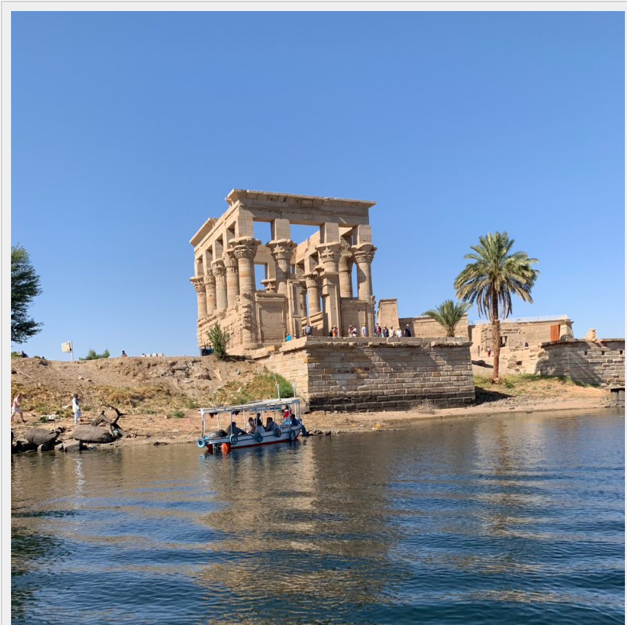
Where the Isis Temple sits now. Agilkia Island.

Our visit to Philae and the Temple of Isis was perfectly timed. Philae is the island on the Nile where the Temple of Isis originally was placed. Because of a dam project, the temple was moved by Unicef to a nearby island. We first visited the entryway of the original temple with a small boat. You could immediately feel the beautiful energy. It felt appropriate that the Temple Of Isis, the Goddess of feminine beauty, fertility, emotional healing, and love would be on the water. We had a private ceremony and a meditation here that was really special.